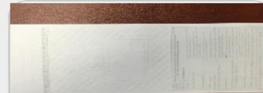
Back of Check