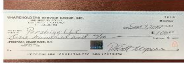
Front of Check