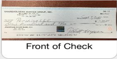
Front of Check