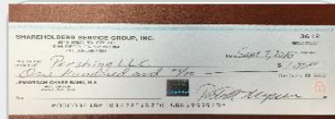
Front of Check