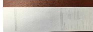
Back of Check